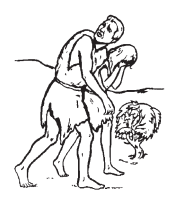
Adam and Eve are driven from the garden

God loved Adam and Eve, but now sin had come between Himself and them. God pronounced His judgment upon them. They would have to leave the beautiful Garden of Eden. Hereafter, man would have to work hard to get his food from the ground. Eve would be subject to her husband and would bear children in sorrow and pain. The ground itself