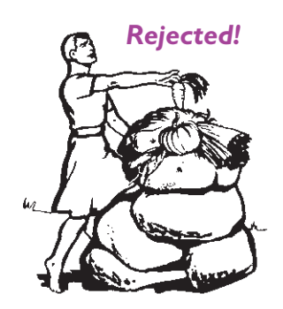
Cain offering fruit of the ground

In the course of time, both Cain and Abel brought their offerings to God. Cain was a farmer and he brought the fruit of the ground for his offering. No doubt he brought beautiful vegetables and fruit, but God rejected his offering.