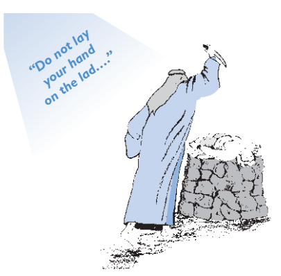
God spared Abraham's son, but He did not spare His own Son.