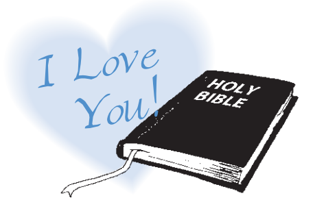
The Bible is God's love letter to us.

What is the Bible about? The Bible is the story of man's complete ruin in sin and God's perfect salvation in Christ. The Bible is God's love letter to us, telling us that, even though we have turned away from God and broken His commandments, God still loves us with all His heart and He wants us to come back to Him.