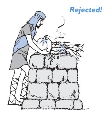
Cain offering fruit of the ground

In the course of time, both Cain and Abel brought their offerings to God. Cain was a farmer and he brought the fruit of the ground for his offering. No doubt he brought beautiful vegetables and fruit, but God rejected his offering.