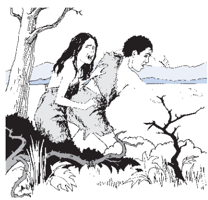
Adam and Eve are driven from the garden.

God loved Adam and Eve, but now sin had come between Himself and them. God pronounced His judgment upon them. They would have to leave the beautiful Garden of Eden. Hereafter, man would have to work hard to get his food from the ground. Eve would be subject to her husband and would bear children in sorrow and pain. The ground itself would be cursed because of their sin.