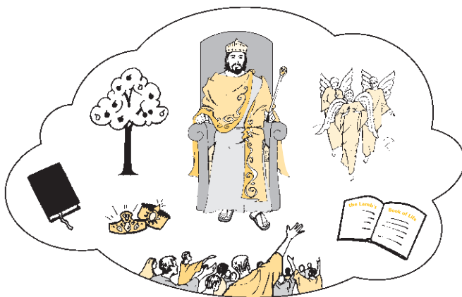
These WILL BE in Heaven

Now I have some wonderful news for you: God wants YOU to be in Heaven with Him! This is true. God knows your name and He wants you to be in Heaven with Him some day.