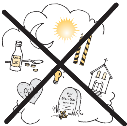
These WILL NOT be in Heaven

The most wonderful thing about Heaven is this: the Lord Jesus will be there! He is our Savior—the One who died on the cross for our sins, so we could be forgiven of our sins and go to Heaven.